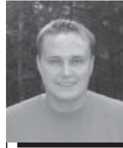
Introducing NEFF's Youngest Forest Steward